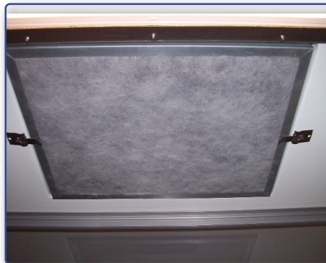
Install new filter and re-latch filter clips