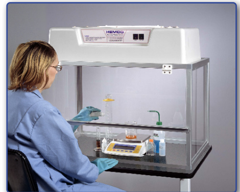
Demo hood is ready for use